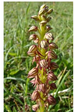
Picture: Man Orchid